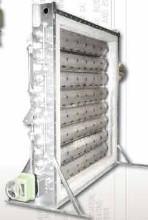
Refractory Lined Louver