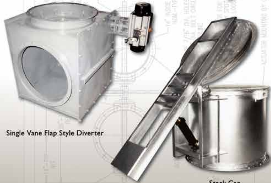
Single Vane Flap Style Diverter