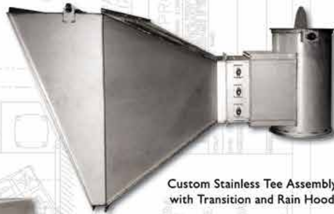
Custom Stainless Tee Assembly with Transition and Rain Hood