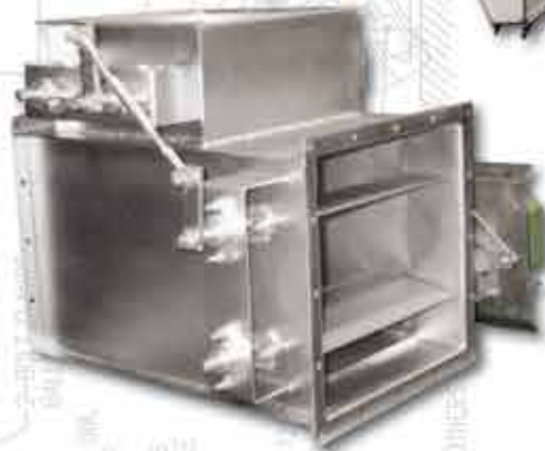
Louver Style Tee